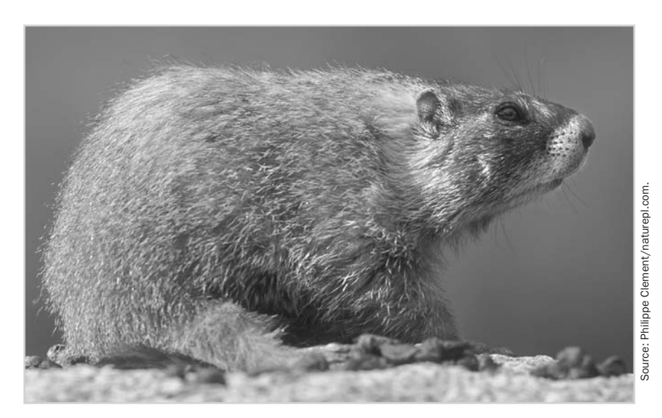
Yellow-bellied marmots (Marmota flaviventris) advanced their emergence from hibernation by 23 days in the Rocky Mountains, presumably due to global warming.

We can choose a course to reverse greenhouse gas growth and promptly change our energy strategy. A step in the right direction was the April 2007 decision by the US Supreme Court that the Environmental Protection Agency can and should regulate greenhouse gas emissions. However, much more is needed.