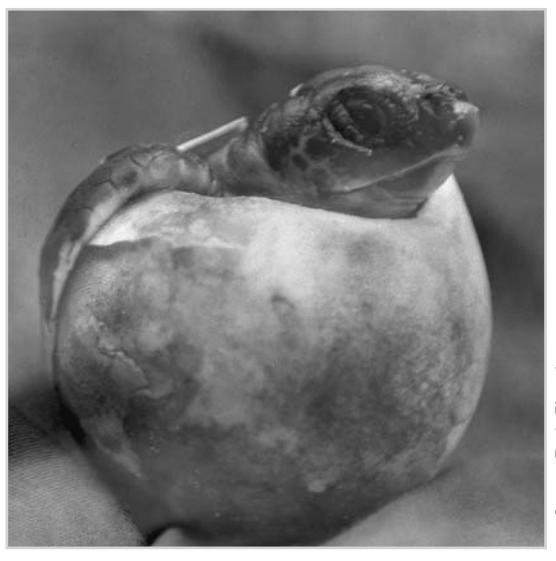
Loggerhead turtle ( Caretta caretta ) hatchling emerging from egg. Loggerhead decline has been arrested by the protection of nesting areas on Florida beaches and other measures, but these areas will be threatened by rising sea level.

The crystallizing science points to an imminent planetary emergency. The dangerous level of carbon dioxide, at which we will set in motion unstoppable changes, is at most 450 parts