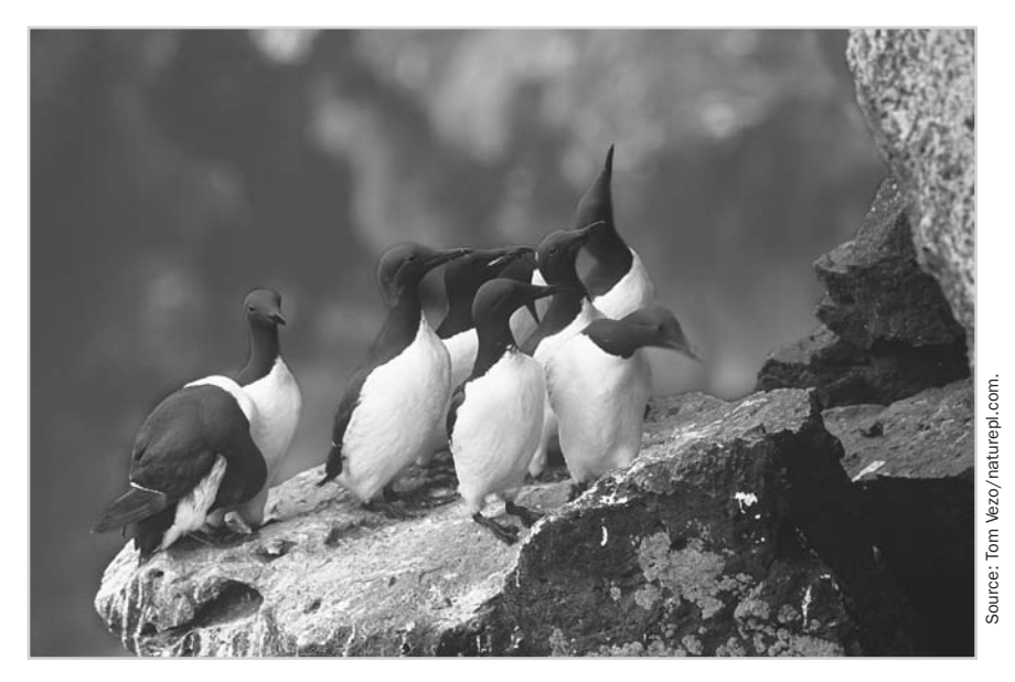
Brünnich's guillemot (Uria lomvia), an Arctic seabird, has advanced its egg-laying date at its southern boundary, a phenological change due to global warming.

The warming that has already occurred, the positive feedbacks that have been set in motion, and the additional warming in the pipeline together have brought us to the precipice of a planetary tipping point. We are at the tipping point because the climate state includes large, ready positive feedbacks provided by the Arctic sea ice, the West Antarctic ice sheet, and much of Greenland's ice. Little additional forcing is needed to trigger these feedbacks and magnify global warming. If we go over the edge, we will transition to an environment far outside the range that has been experienced by humanity, and there will be no return within any foreseeable future generation. Casualties would include more than the loss of indigenous ways of life in the Arctic and swamping of coastal cities. An intensified hydrologic cycle will produce both greater floods and greater droughts. In the US, the semiarid states from central Texas through Oklahoma and both Dakotas would be-