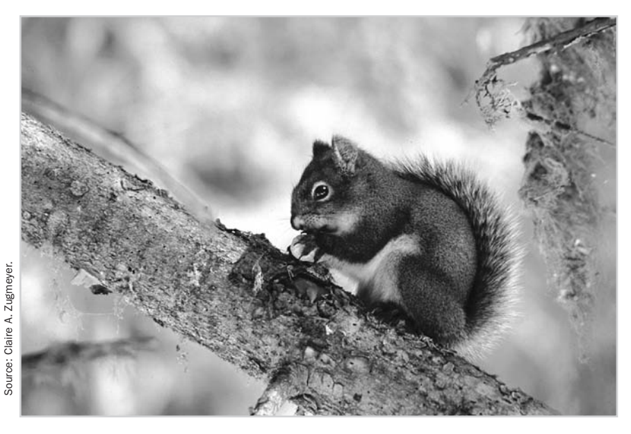
The Mount Graham red squirrel ( Tamiasciurus hudsonicus grahamensis ) survives on a single mountain in Arizona. "Green islands" on mountains, and the species that live on them, are pushed higher as temperatures rise, and will be pushed off the planet if global warming continues.

Some species face extinction. The following examples represent a handful. Of particular concern are polar species,